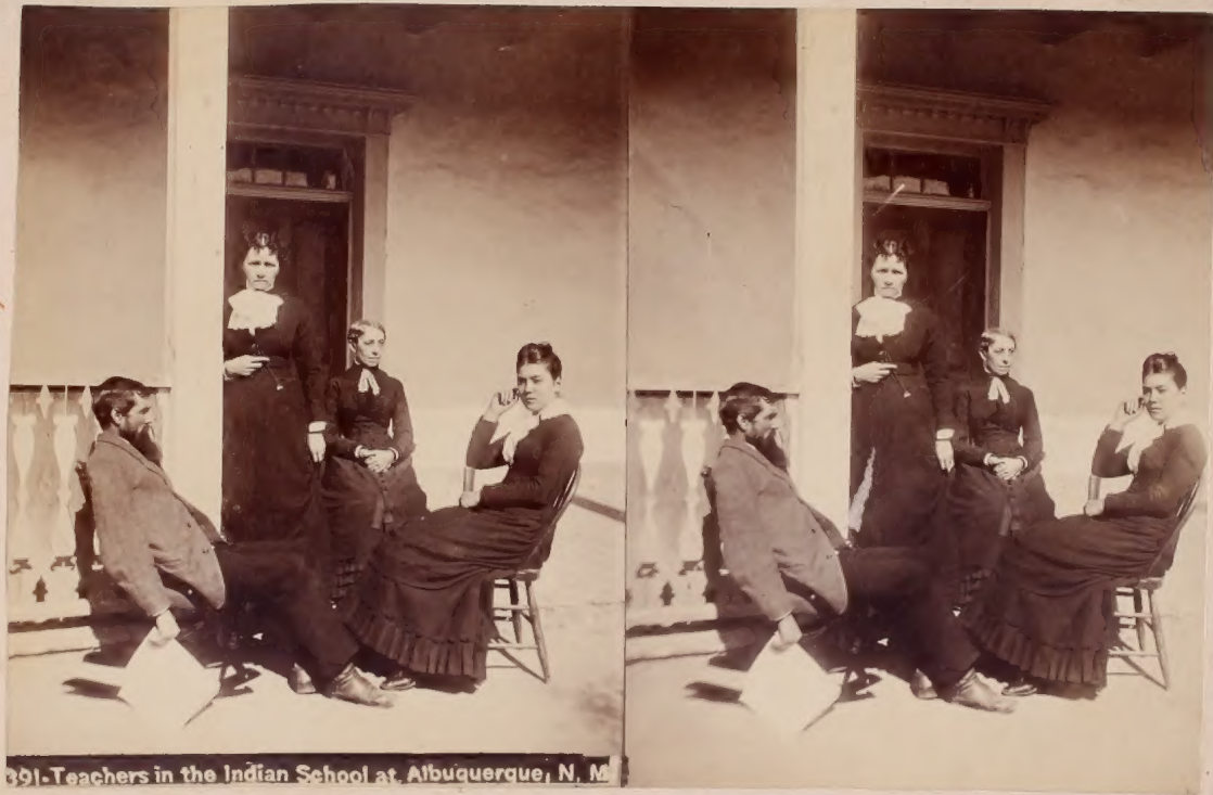
391-Teachers in the Indian School at Albuquerque, N. M.